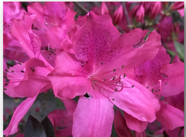
Azaleas blooming in front of Good Shepherd Church.

This is my Father's world And to my listening ear All Nature sings and round me rings The music of the spheres. This is my Father's world I rest me in the thought Of rocks and trees, of skies and seas, His hand the wonders wrought!