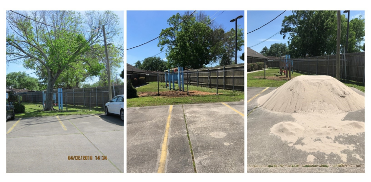
Tree Tree removed Load of dirt

Phase one of construction, of the Prayer Garden, was getting that old tree taken down, removed and the tree stump ground down. This was completed on Friday, April 5, 2019. In reality, with or without construction of the Prayer Garden, the tree was in a condition that arborists call "end of life" and that was placing it at risk for coming down during a storm--something that could cause significant building damage.