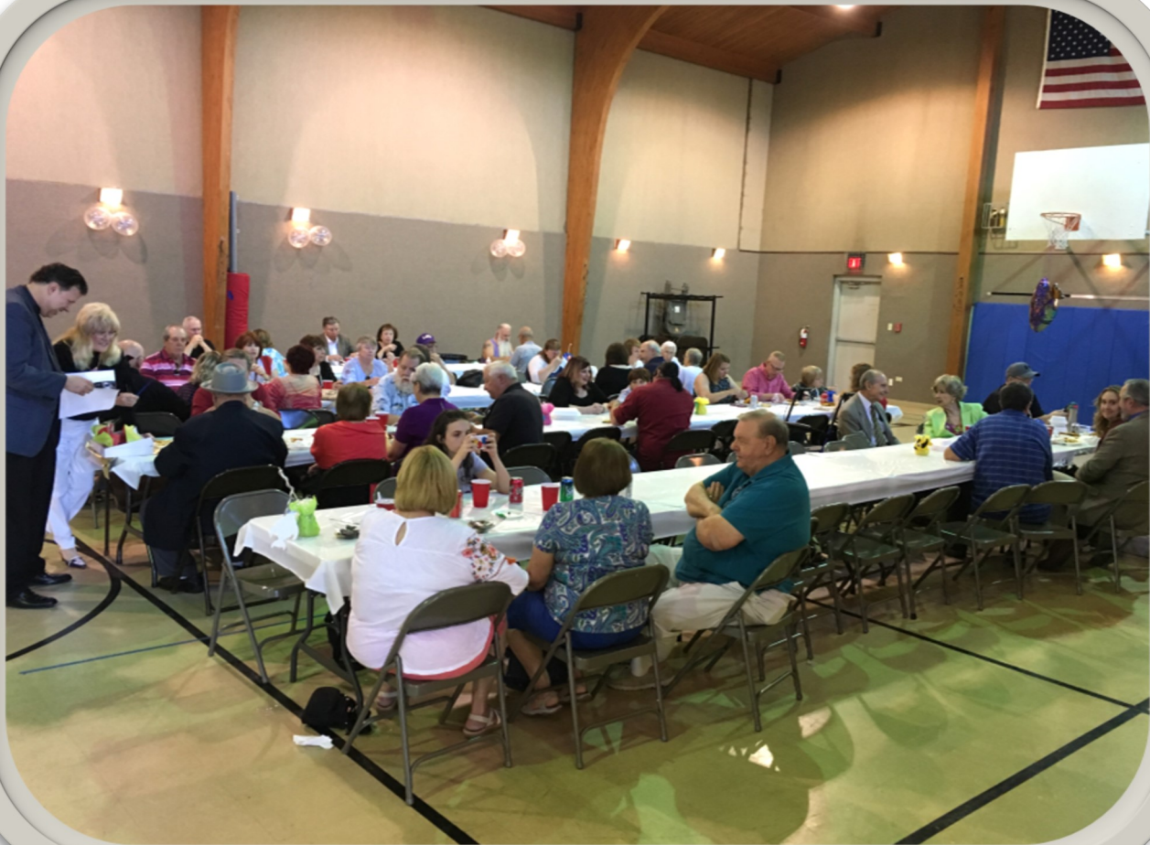
Some of the folks who dined in with us at our church fish fry in the fellowship hall on Sunday, May 6, 2018.