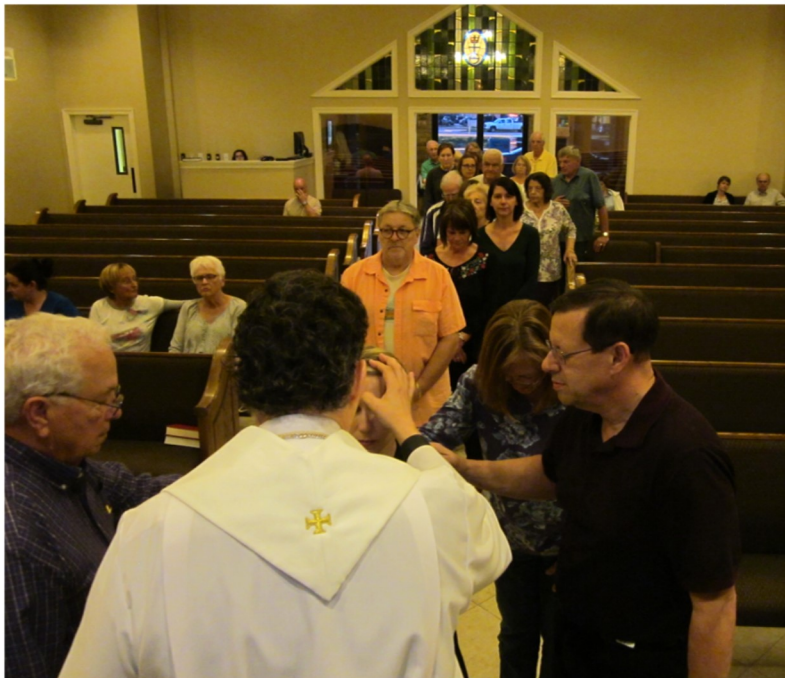
Worshippers come forward to be anointed with holy oil, have hands laid upon them, and be prayed for by elders.