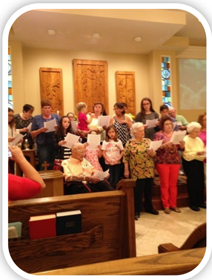
Crescendo sings in Spring 2017.